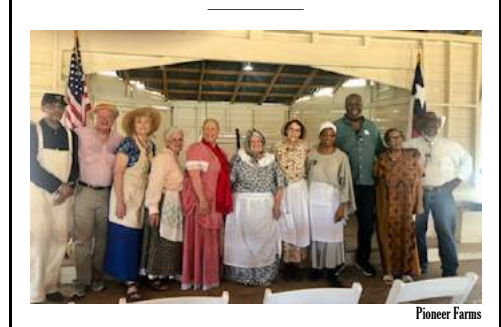
Our annual Pre-Juneteenth special program has become a popular learning event on African-American history.

HEAR UNION GENERAL'S ORDER, SEE SPECIAL ARTS PROGRAM, TOUR ORIGINAL FREEDMAN'S HOME.