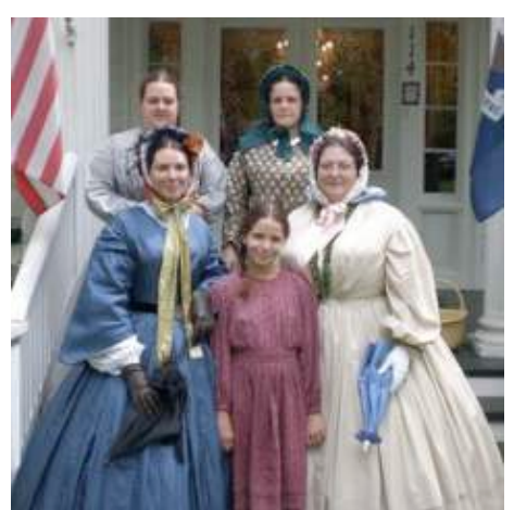
Women in typical 1800s attire pose on the front steps.